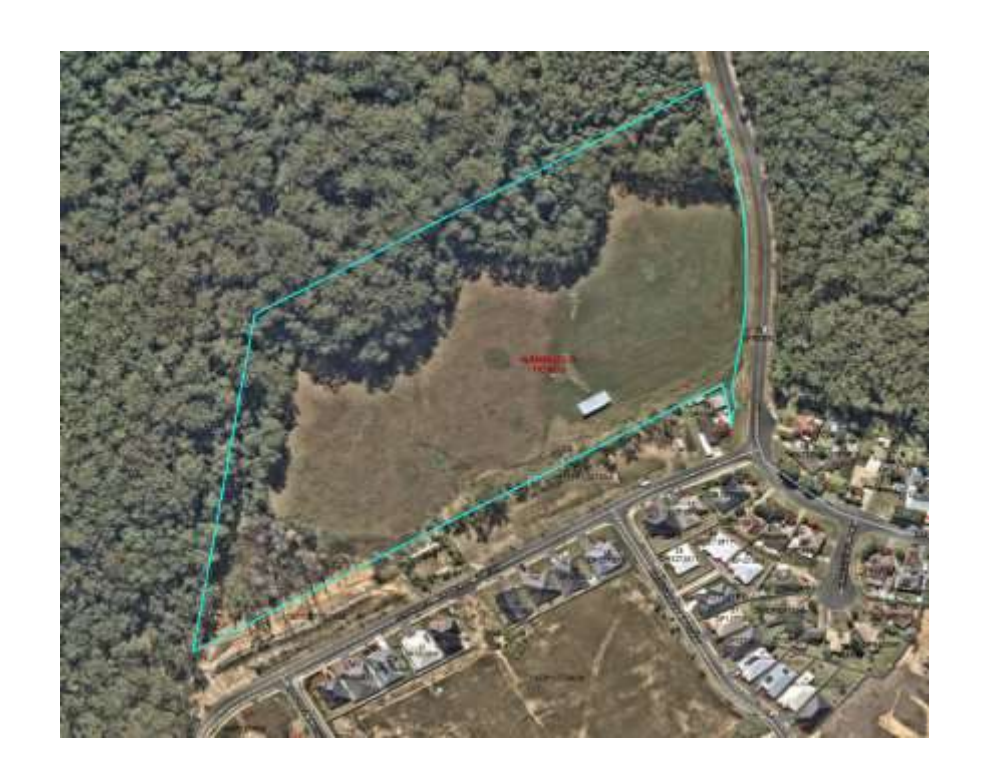
FARINGDON FIELDS AREA OF CULTURAL SIGNIFICANCE LOT 76 DP 832082 - MARSHALL WAY, NAMBUCCA HEADS